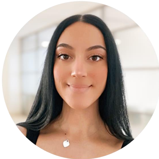
7 - eReports Speaker