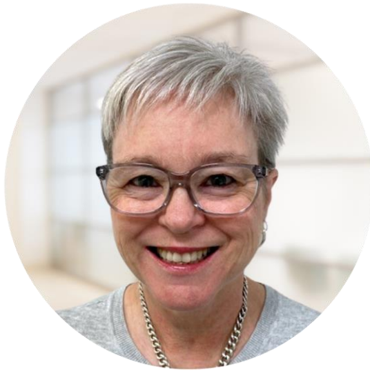
6 - eReports Speaker